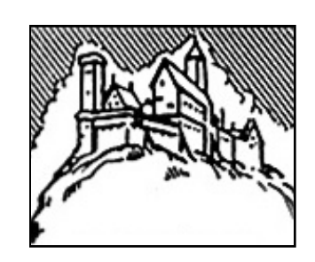
A MIGHTY FORTRESS IS OUR GOD

Liturgical Notes: The colors up from have been changed to red for the Festival of Reformation. Red symbolizes the working of the Holy Spirit in hearts through the preaching of God's Word, as on the Day of Pentecost. The Holy Spirit showed His presence then in tongues of fire which came to rest on the apostles (Acts 2:3). Red, being the color of blood, may also remind us of the dedication of such servants of God as Martin Luther who were willing to suffer and even shed their blood, if need be, for the sake of the Gospel message of salvation by grace through faith alone in Jesus Christ.