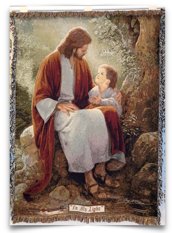
For with You is the fountain of life; in Your light we see light. Psalm 36:9

"The Women of the Southeastern Conference of the CLC will host a women's retreat at Myrtle Beach, SC October 7-9, 2022. CLC women who would like to join us (as well as any friends you would like to bring) can obtain a registration form from their pastor or can find it on the 'CLC Southeastern Women's Retreat Information' Facebook page. The registration deadline is September 1, 2022."