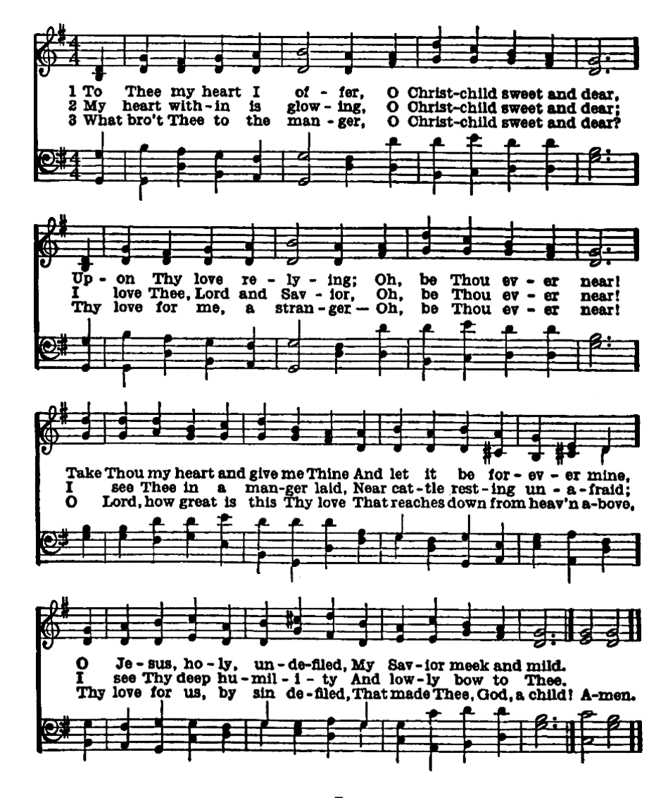
To Thee My Heart I Offer The Lutheran Hymnal #89