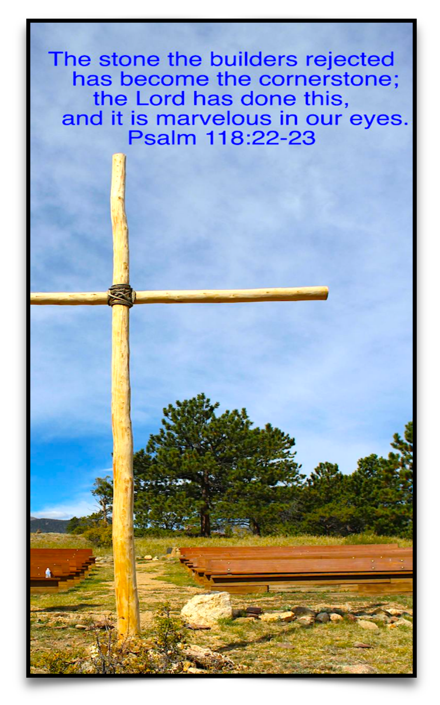
5th Sunday in Lent April 3, 2022

Church of the Lutheran Confession – Lakewood, Colorado