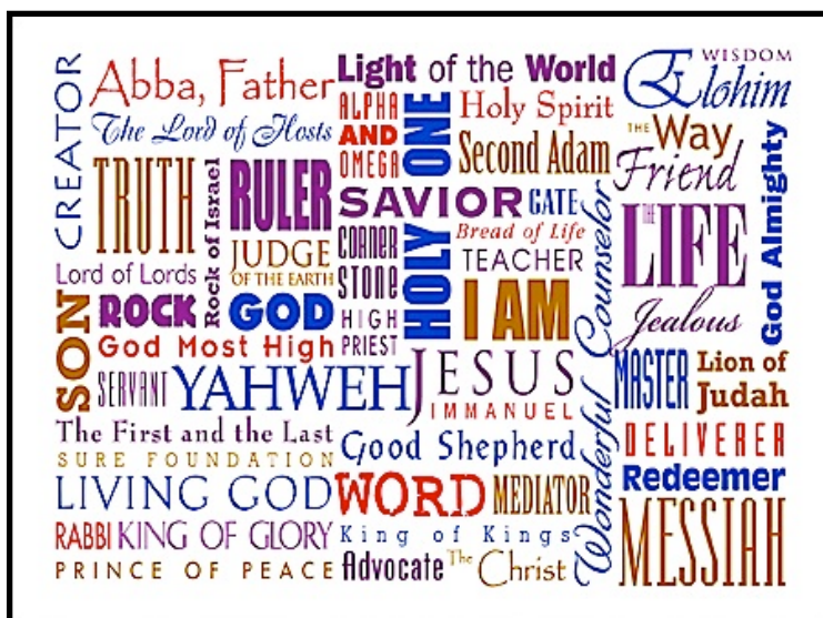
Names of the Lord Found in the Bible

After reliving the great events of the life of Christ in the "festival half" of the church year (December-June), the worshipping Church spends the remainder of the church year (June-November) focusing on the teachings of Christ ("non-festival half"). The liturgical paraments up front are green in color to remind us that the Holy Spirit uses those teachings of Jesus to help us to grow in our faith. Appointed lessons during this time cover a great body of doctrine for our faith and life as God's people. This year – in upcoming weeks – we plan to review in the sermons God's will for our lives as summarized in the Ten Commandments. Today's topic: The Second Commandment.